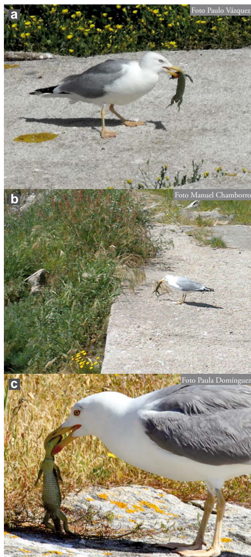
Figure 2: Larus michabellis feeding on Timon lepidus . (a) Sálvora Island, 31/5/2009; (b) Faro Island, Cíes, 13/5/2013; (c) Monteagudo Island, Cíes, 30/5/2015.

We believe that this behaviour is not very common on these islands, taking into account that, since the first cases, the National Park workers have been very attentive to these events. In addition, we have been carrying out analysis of gull pellets over several years, without having found lizard remains in them (Atlantic Islands National Park, unpublished data). Considering the high number of gulls on the islands and the low number of events observed, they could represent a case of specia-