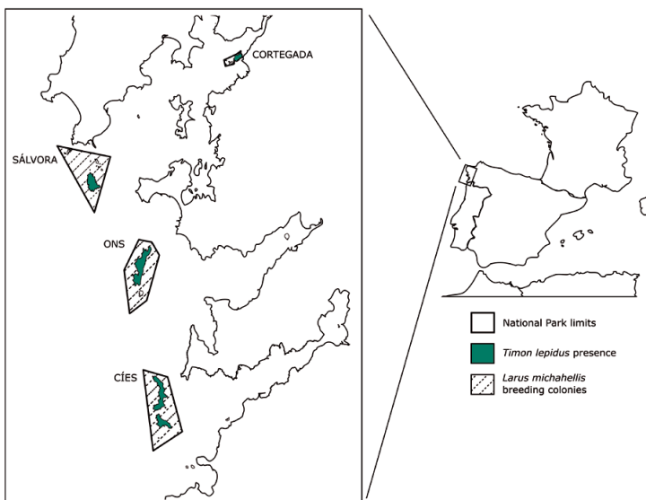
Figure 1: Distribution of T. lepidus (Galán, 2007) and L. michahellis (Pérez et al. , 2012) in the Atlantic Islands National Park.

We registered seven events of L. michahellis feeding on T. lepidus . In four of these cases, the